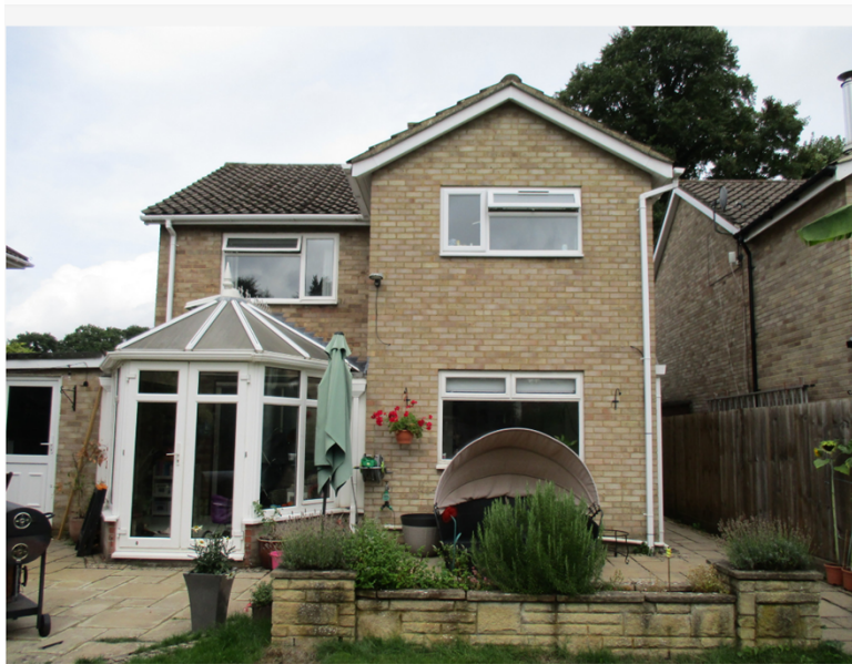
The existing rear elevation of No.22.

18/0579 – 22 Wharfenden Way, Frimley, Camberley, GU16 6PJ