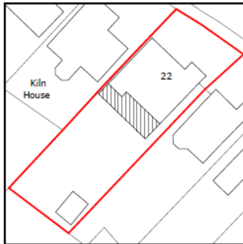
SITE PLAN - PROPOSED SHOWN HATCHED SCALE 1:500