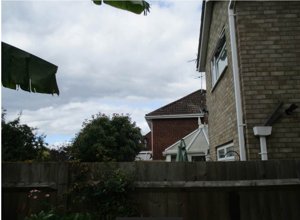
View from No.24's rear garden.

18/0579 – 22 Wharfenden Way, Frimley, Camberley, GU16 6PJ