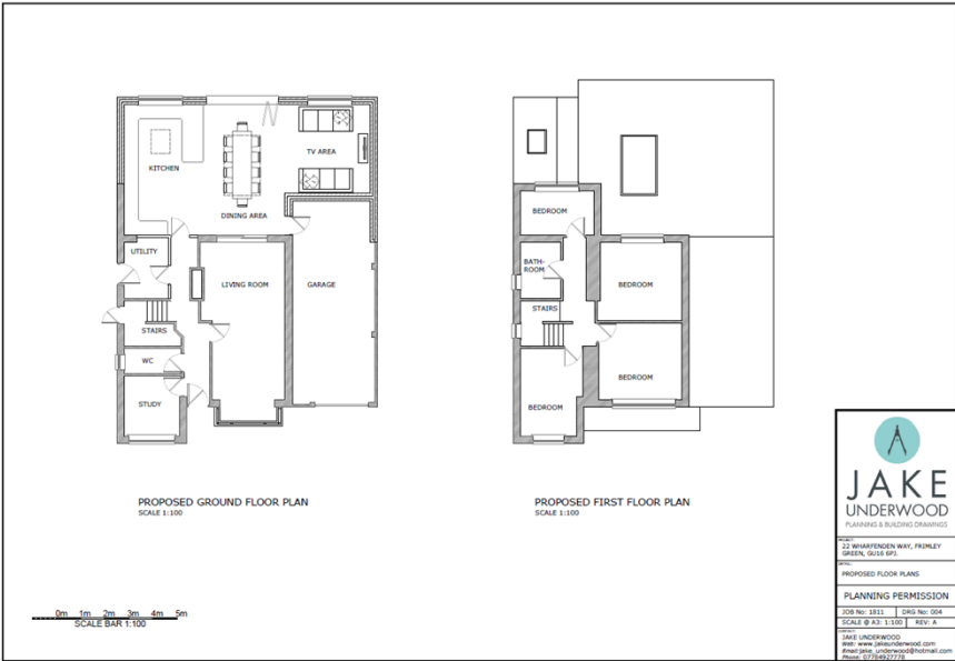
Proposed floor plan