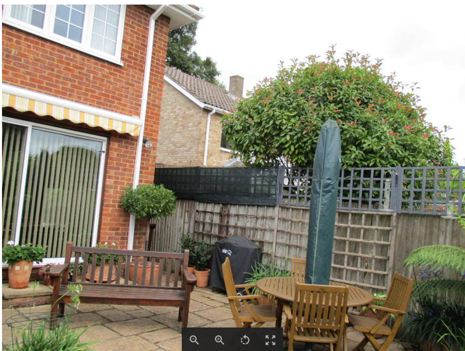
View from No.20's rear garden.